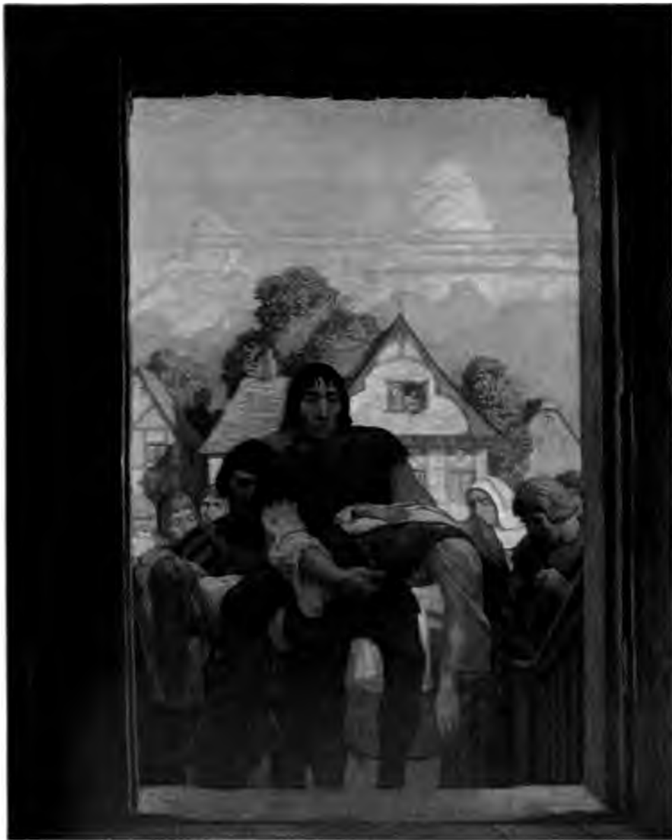
Painting by N. C. Wyeth

THERE WAS A SOUND OF TRAMPING OUTSIDE AND THE CROWD CAME SOLEMNLY IN